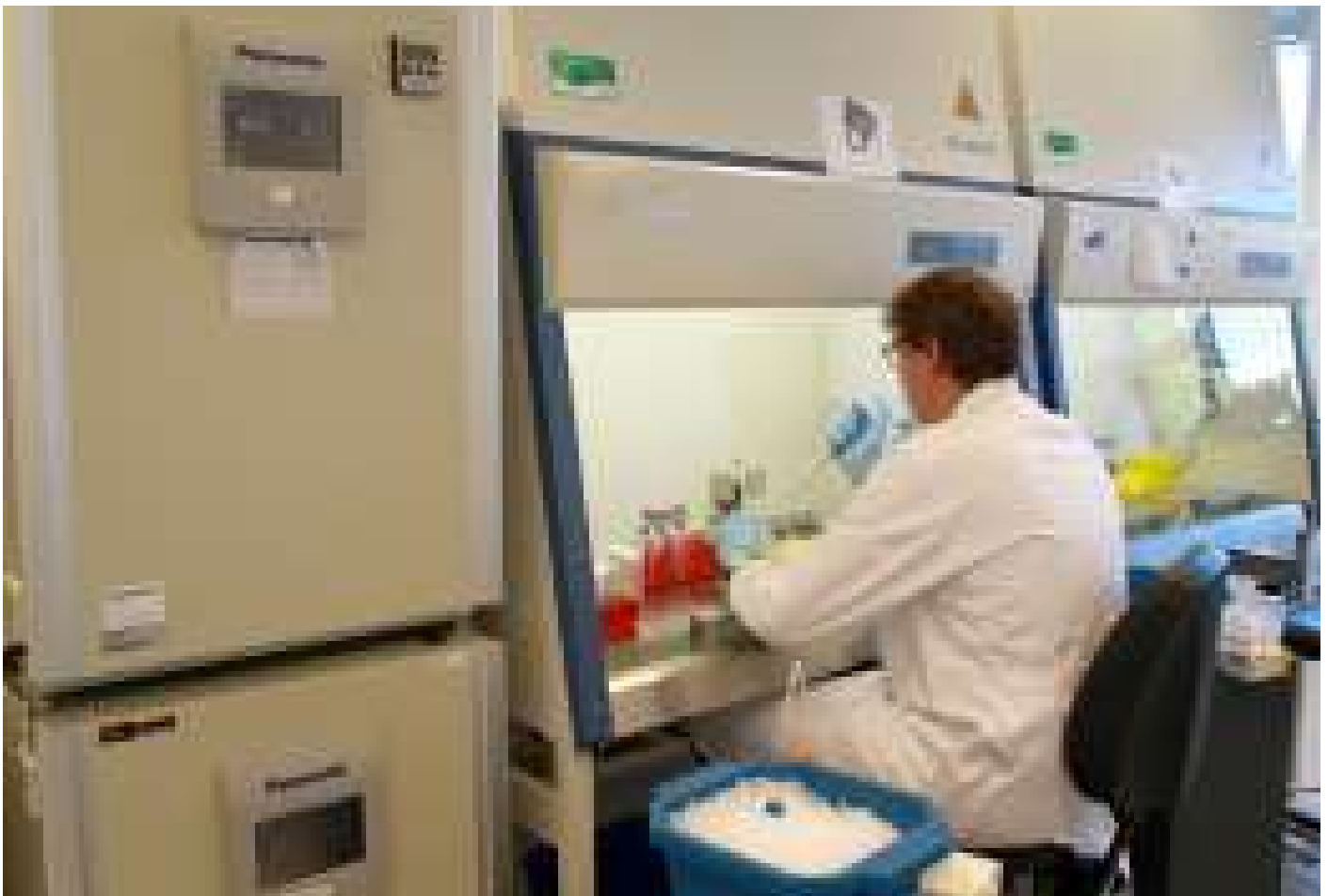
The laboratories for tissue cultivation are organisationally divided across three departments: oncology, CF and other illnesses, and screening.